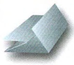
DOUBLE PARALLEL FOLD