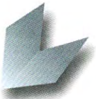
LARGE HALF FOLD